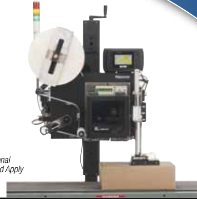
Picture shows optional upgrade to Print and Apply